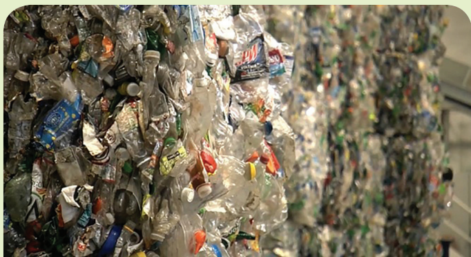
EcoStar purchases bales of PET and thermoforms from local MRFs, and has the capacity to recycle them at a rate of 36 million lb/yr at its closed-loop plant in Fitchburg, Wis.