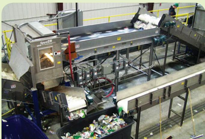
Non-PET bottles are sorted out by infrared technology.